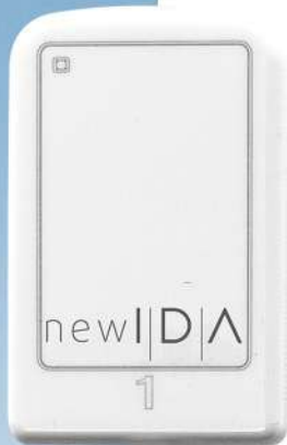
Size 1 active area: 20x30 mm